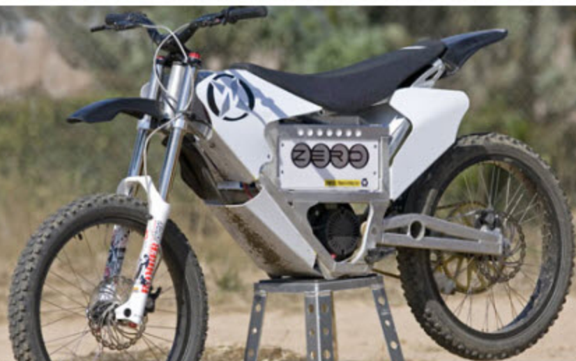
2009 Zero X Electric Motocrosser